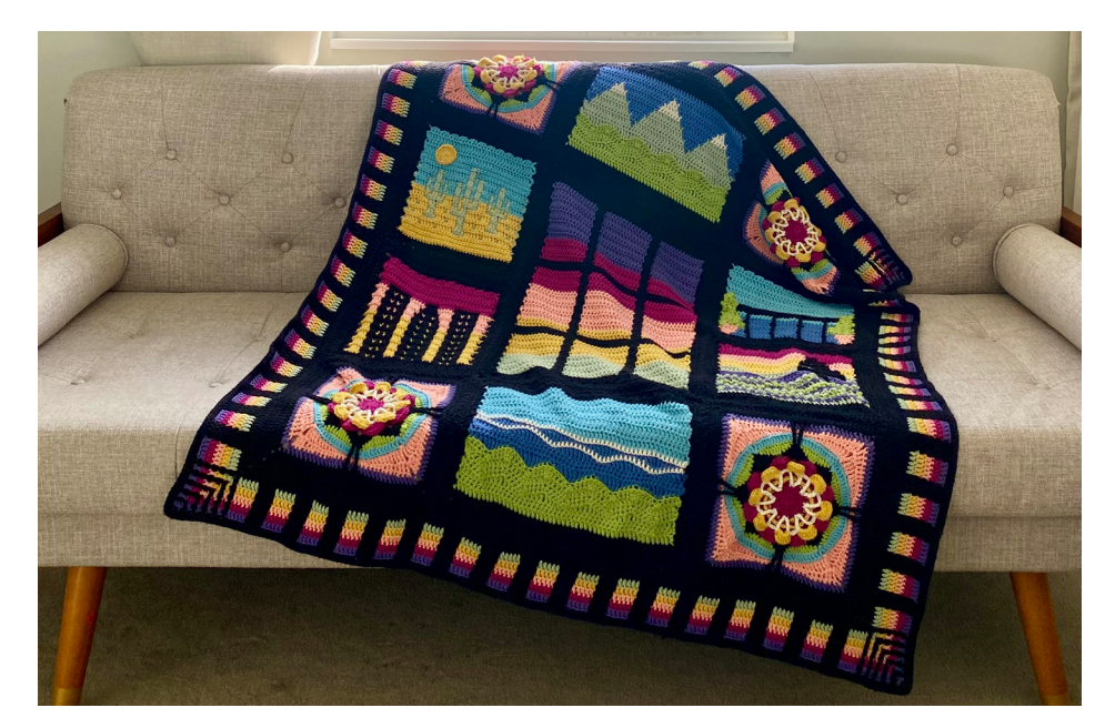
Join us next week for The Border: Part One...

Join Yarn A into the outer right corner ch-sp of the front square only, 1 ch, insert hook into corresponding corner ch-sp on back square, make 1ss followed by 1ch, 1ss in first st on front square, 1ch, miss first st on back square, 1ss in next st on back square, 1ch, *miss 1 st on front square, 1 ss in next st on front square, 1ch, miss 1 st on back square, 1ss in next st on back square, 1ch, repeat from * across side to final st on back square, 1ch, miss final st on front square, 1ss in corner ch-sp on front square, 1ch, 1ss in corner ch-sp on back square, fasten off. Join the 3 strips together following the same joining method. Place the WS facing together and RS facing outwards. Each time a corner chsp is reached work into the corner ch-sps of both the front and back square or rectangle as in the 'joining squares' instructions above. Continue to work into alternate sts across.