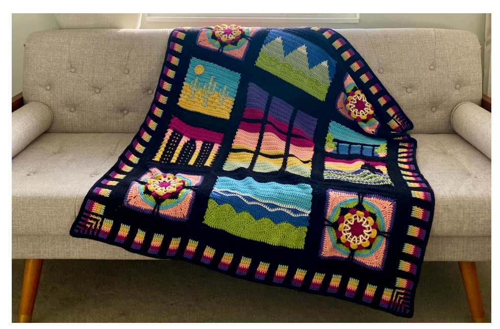
Join us next week for The Border: Part One...

Join the 3 strips together following the same joining method. Place the WS facing together and RS facing outwards. Each time a corner chsp is reached work into the corner ch-sps of both the front and back square or rectangle as in the 'joining squares' instructions above. Continue to work into alternate sts across.