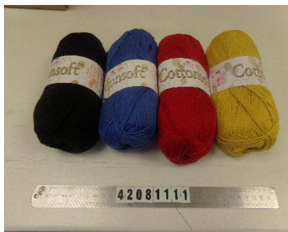
Photo of submitted sample

I certify that the above mentioned sample has been tested in accordance with the standard / regulation(s) specified below and that it complies or otherwise as follows: