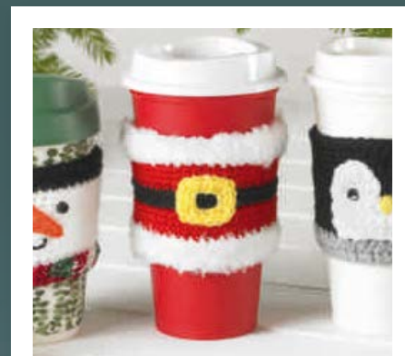
Excerpt from Christmas Crochet Book 6